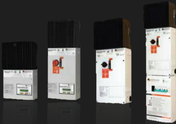
Standard, DB, TR, and TR with GFPD versions shown with optional display meters